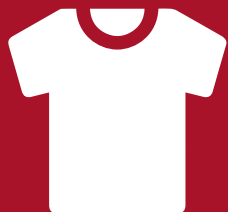
Clothes and fabric

The oil should be placed in tightly closed plastic bottles, taking care not to pour the contents on the ground.